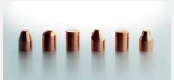
Z-Trode® cap electrodes