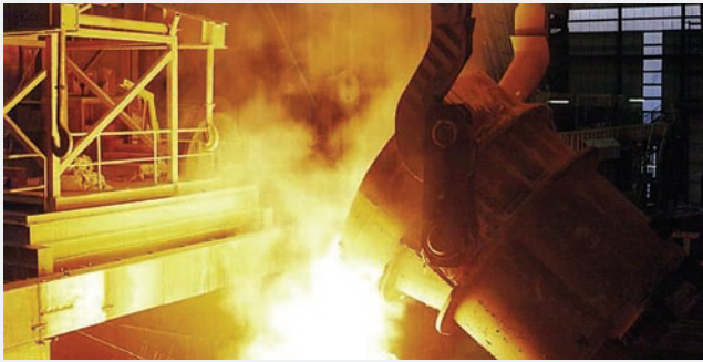
Oxygen free copper casting